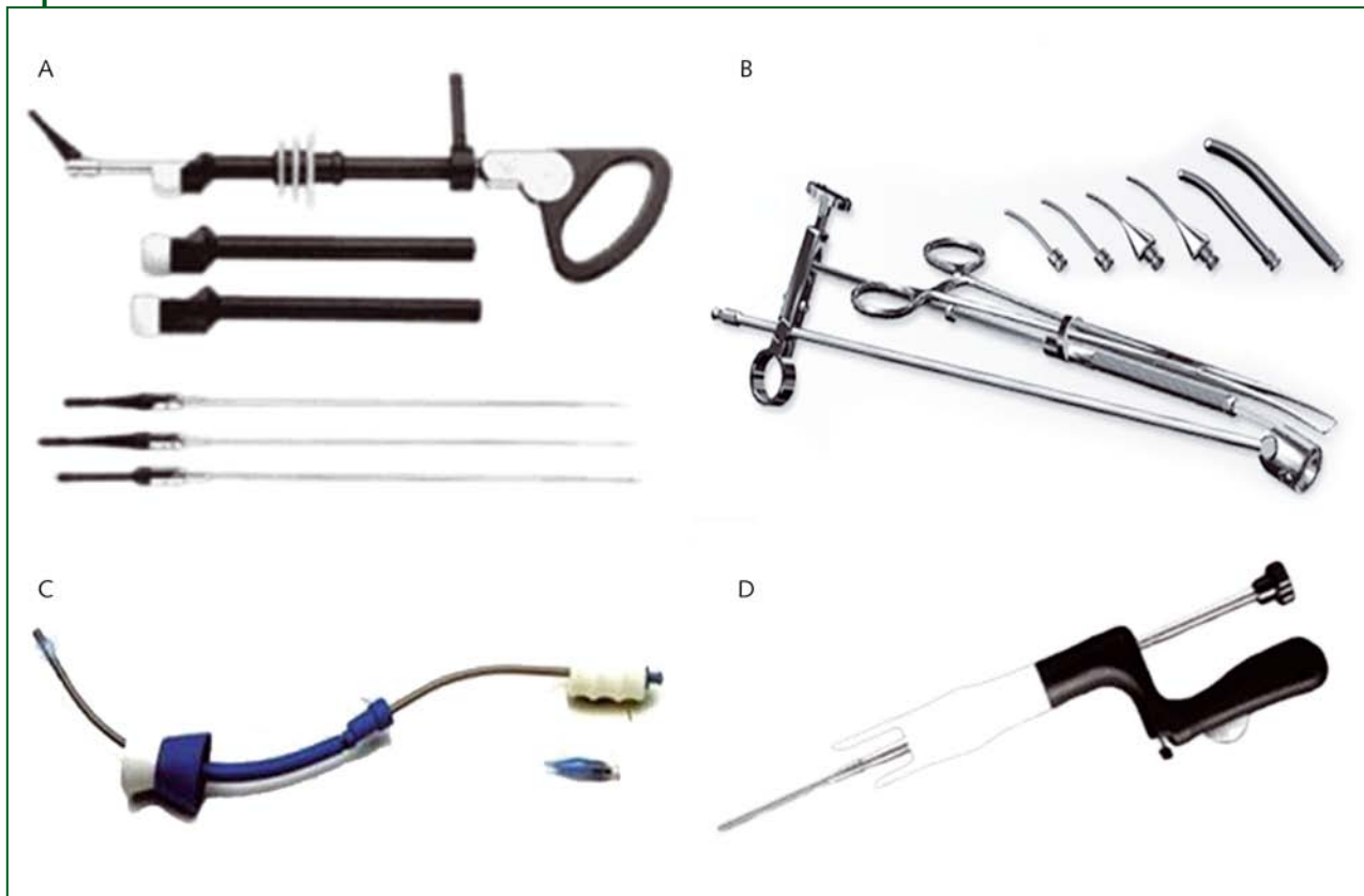
Figure 1. Uterine manipulators: Clermond-Ferrand Uterine Manipulator (A), Valtchev Uterine Mobilizer (B), Vcare Uterine Manipulator (C), HOURCABIE Vaginal Fornices Presenter (D)

positions: anteversion and retroversion, lateral and elevated. Today, the Vcare Uterine Manipulator/Elevator (ConMed Corporation, Utica, N.Y.), the Clermond-Ferrand Uterine Manipulator (Model K.Storz Endoskope,Tuttlingen, Germany), the Valtchev Uterine Mobilizer (Conkin Surgical, Toronto, Canada), and the HOURCABIE Vaginal Fornices Presenter are some examples of the most commonly used manipulators in laparoscopic hysterectomy (Figure 1).